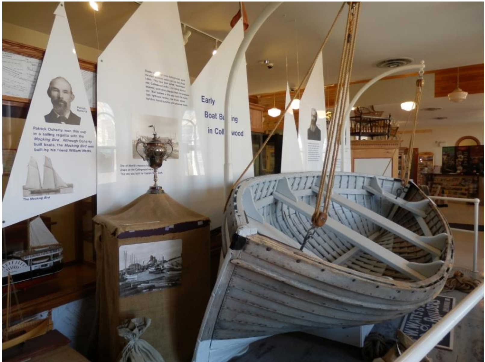
A 20 ft challenge!