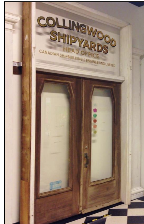
Original Shipyard Doors