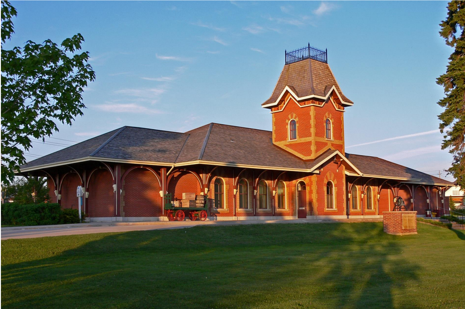
Collingwood Museum: 2010, 2014