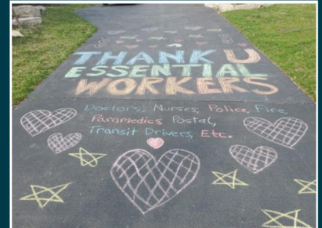
Front Porch Clap