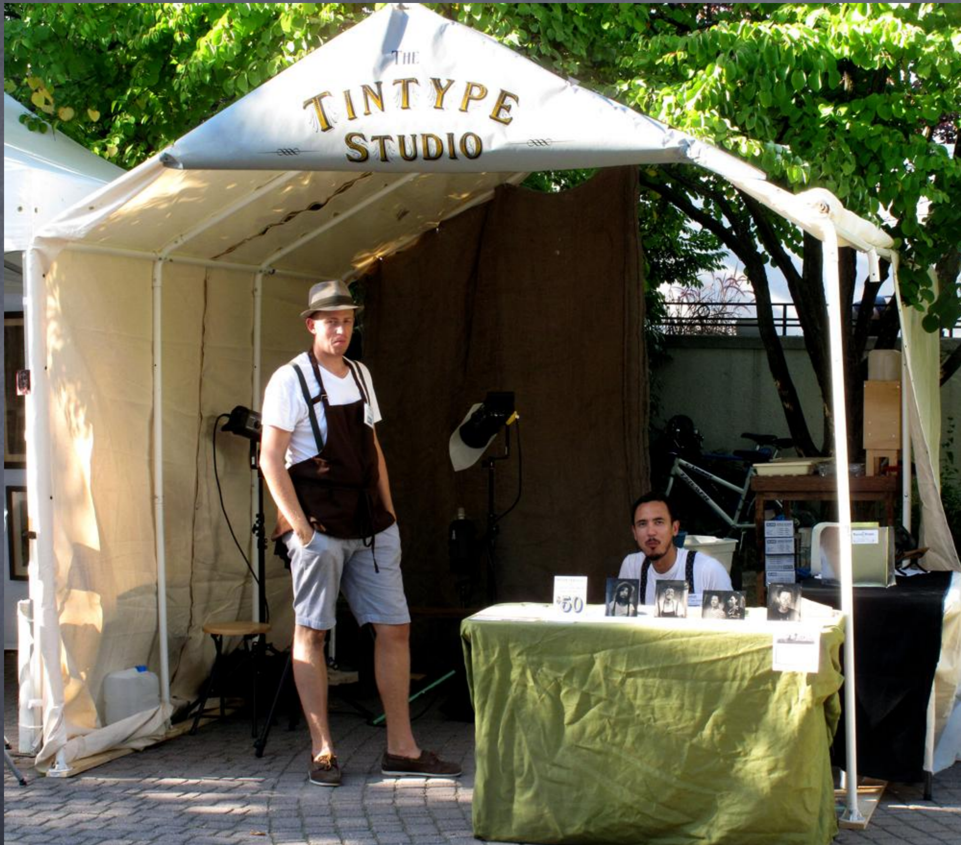
Sunnyside Art Show September - 2011