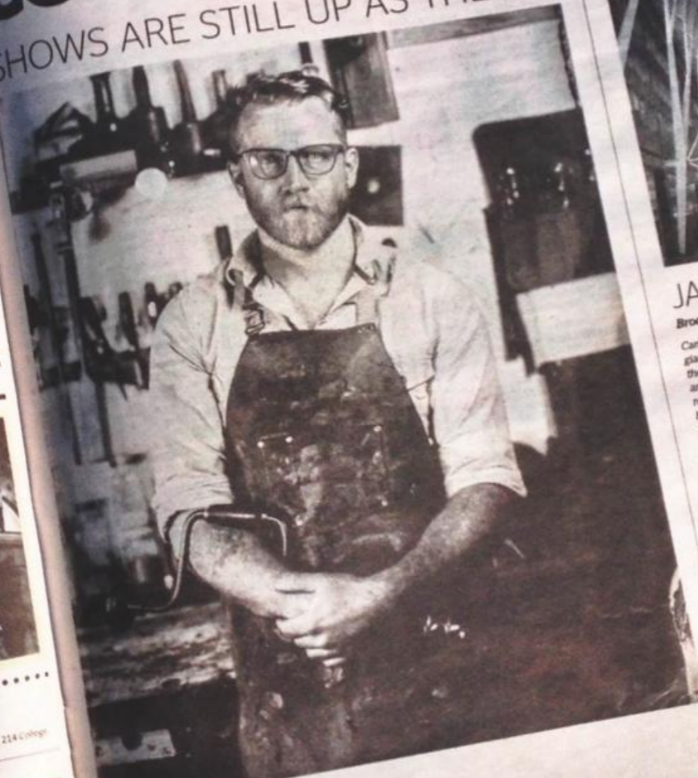
CABINETMAKER FROM THE TINTYPE STUDIO HOW I GOT THE SHOT THE TINTYPE STUDIO Campbell House Museum (160 Queen West, 416-597-0277), to Saturday (June 1).