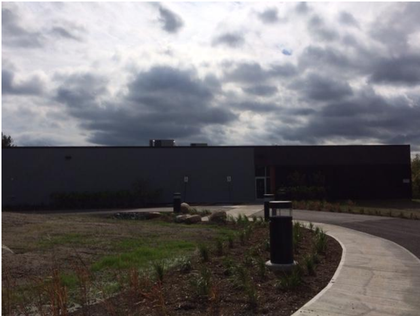
New Curatorial Centre