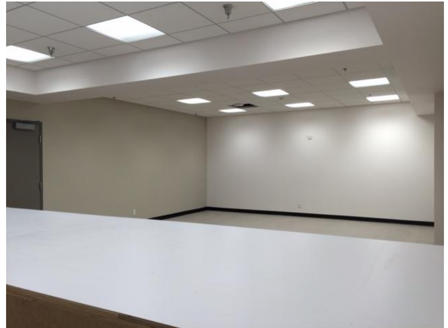
Renovated Archives space