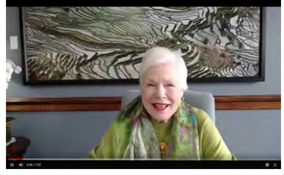
Captured from a video message from the Honourable Elizabeth Dowdeswell, Lieutenant Governor of Ontario. Watch <u>HERE</u>.

In recognition of May is Museum Month and the OMA's 50th Anniversary, the OMA received a video message from the Honourable Elizabeth Dowdeswell, Lieutenant Governor of Ontario. In addition, municipalities across Ontario—Toronto, Ottawa, Brockville, Mississippi Mills, Port Colborne, Sault Ste. Marie—proclaimed May is Museum Month. The OMA developed and shared a downloadable toolkit to assist Association members with their participation in May is Museum Month celebrations, which included template proclamation letters, social media graphics and communication strategies. We collected and published weekly round-ups of exhibitions, programs and events in museums, galleries and historic sites across Ontario to 2,000+ recipients.