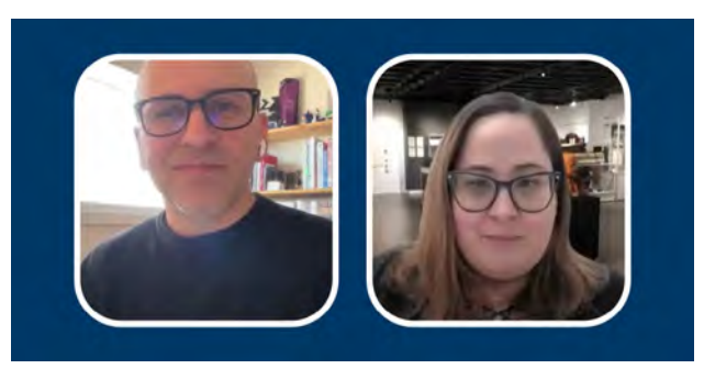
The Digital Strategy - Intention through Application (April 29, 2022)

This year the OMA presented training opportunities to help develop digital skills that meet immediate needs of the small and rural museum community. The OMA presented several webinars as part of the Small Bytes initiative – funded by the Department of Canadian Heritage.