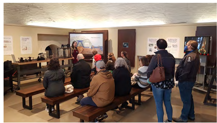
Participants of the It's the Little Things - Small Steps Towards Continuous Improvement at the Hamilton Civic Museums OMA Study Tour

"It's the Little Things: Small Steps Towards Continuous Improvement at the Hamilton Civic Museums" gave participants the opportunity to explore and learn about the City of Hamilton's culture and heritage through the Hamilton Museum of Steam & Technology, Whitehern Historic House and Garden, and Dundurn National Historic Site. Participants learned how front-line museum staff have actively worked to translate corporate strategic goals into bite-size, attainable actions, demonstrating how small things can make big improvements to the visitor experience and can help museums tackle big concepts in tangible ways.